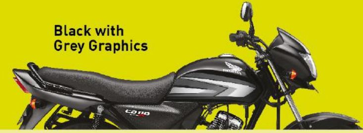
Black with Grey Graphics