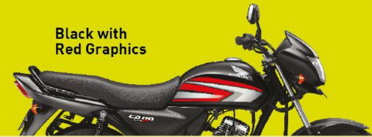
Black with Red Graphics