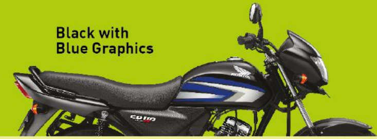
Black with Blue Graphics