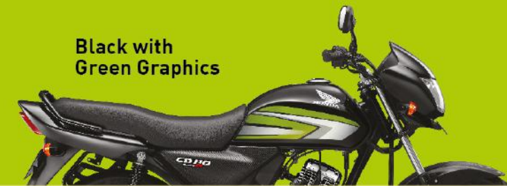
Black with Green Graphics