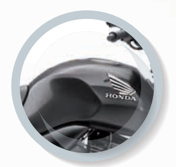
Mat Axis Gray Metallic