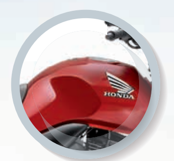
Imperial Red Metallic