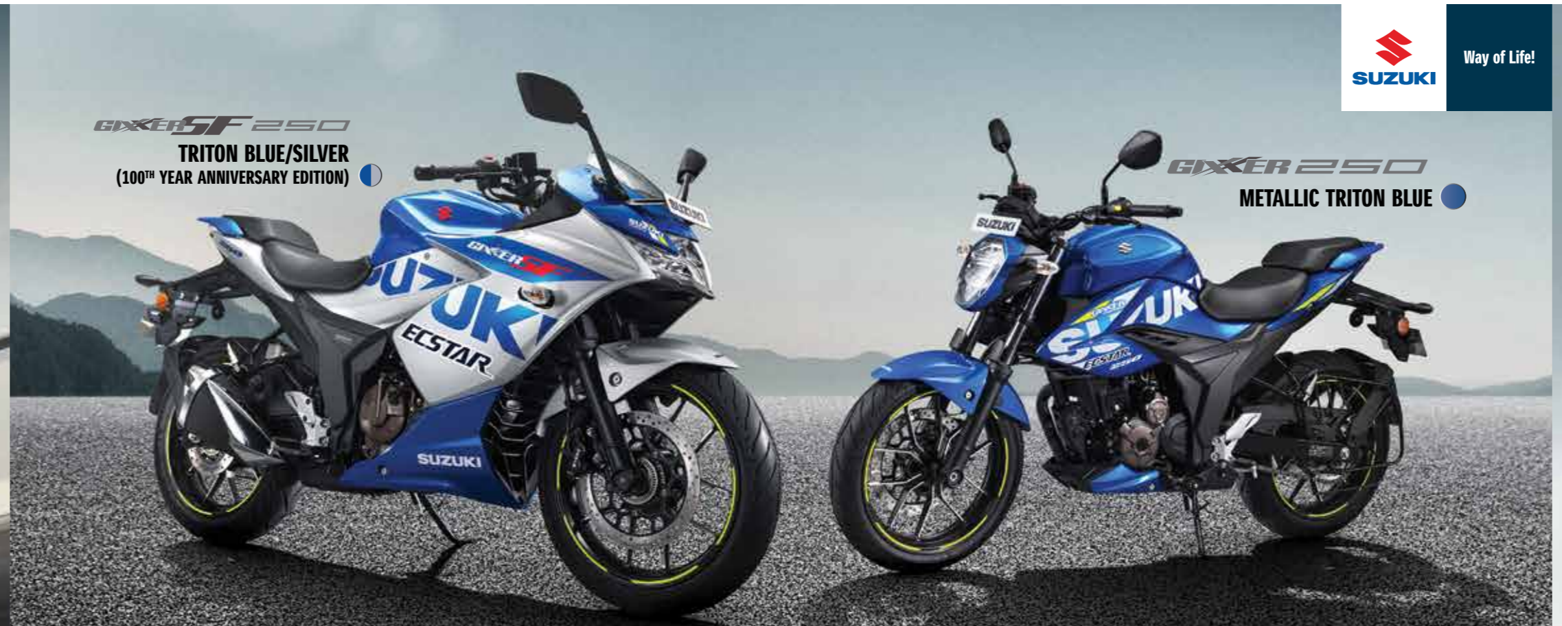
GIXXER SF 250 TRITON BLUE/SILVER (100 TH YEAR ANNIVERSARY EDITION)

ABS DUAL CHANNEL Dual Channel ABS - A light weight and compact dual-channel ABS (Anti-lock brake system) system is installed on both the front and rear wheels. ABS is the supplemental system which automatically controls the braking force efficiently and avoids wheel lock up due to the slippery road, the sudden change in road conditions or excessive braking in a certain controllable range.