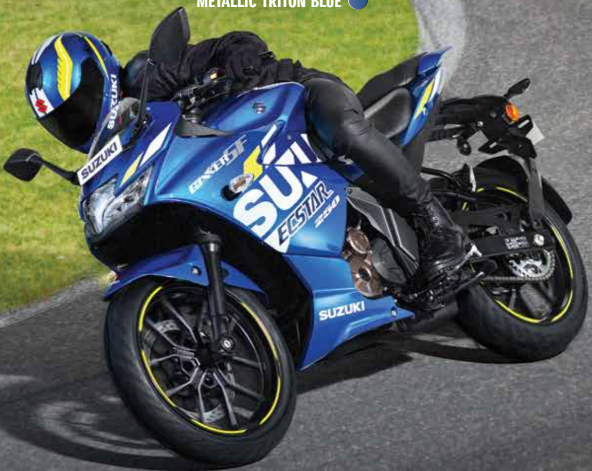
GIXXER SF 250 METALLIC TRITON BLUE