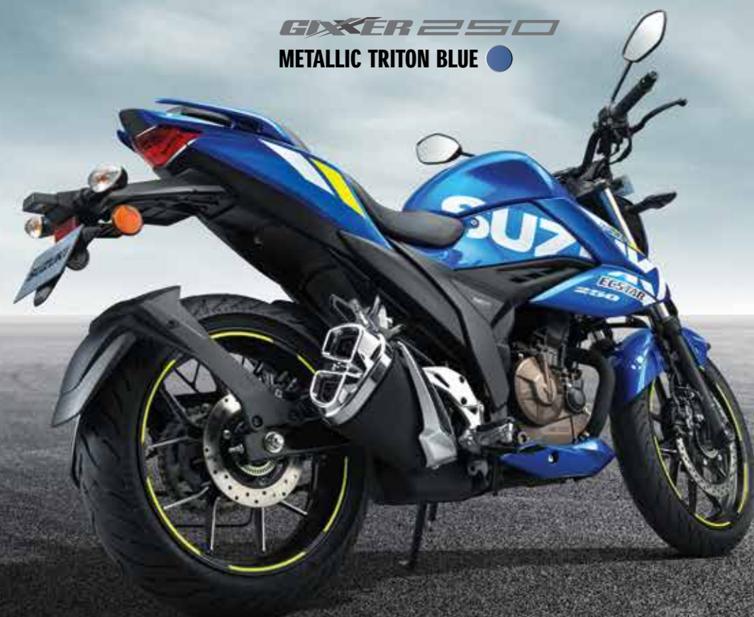
GIXXER 250 METALLIC TRITON BLUE

Suzuki Oil Cooling System (SOCS) - Oil cooling system in engines was first introduced by Suzuki to the world for creating a lightweight and fast engine which provides high performance for a wide range of needs, from city-riding in traffic to serious sport riding using technologies derived from MotoGP such as weight-reduction and friction-reduction technologies. This unique technology also offers a refined acceleration that feels strong and linear. GIXXER SF 250/GIXXER 250 engine provides high output, compactness, low fuel consumption, high durability and ease of maintenance.