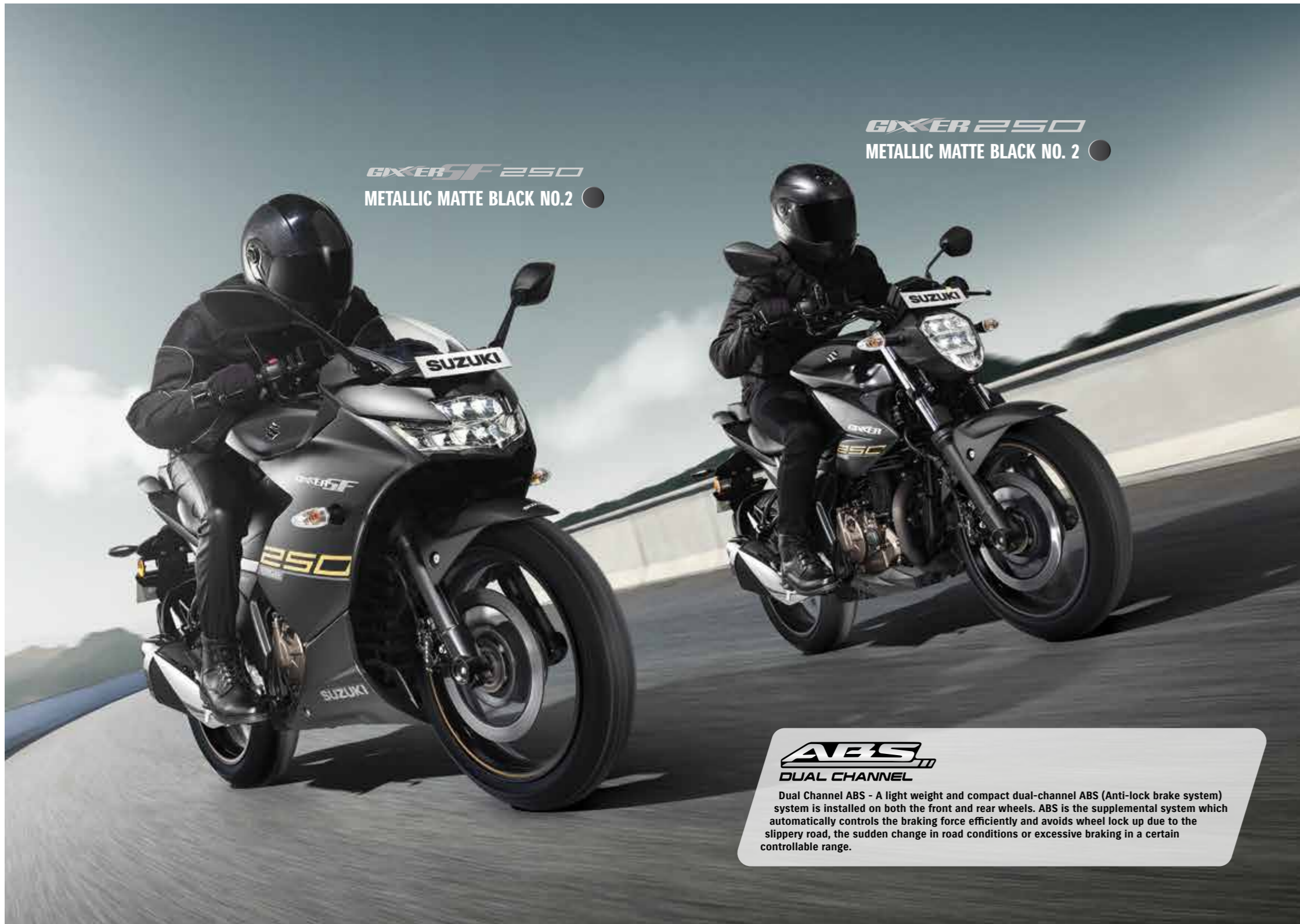
GIXXER SF 250 METALLIC MATTE BLACK NO. 2