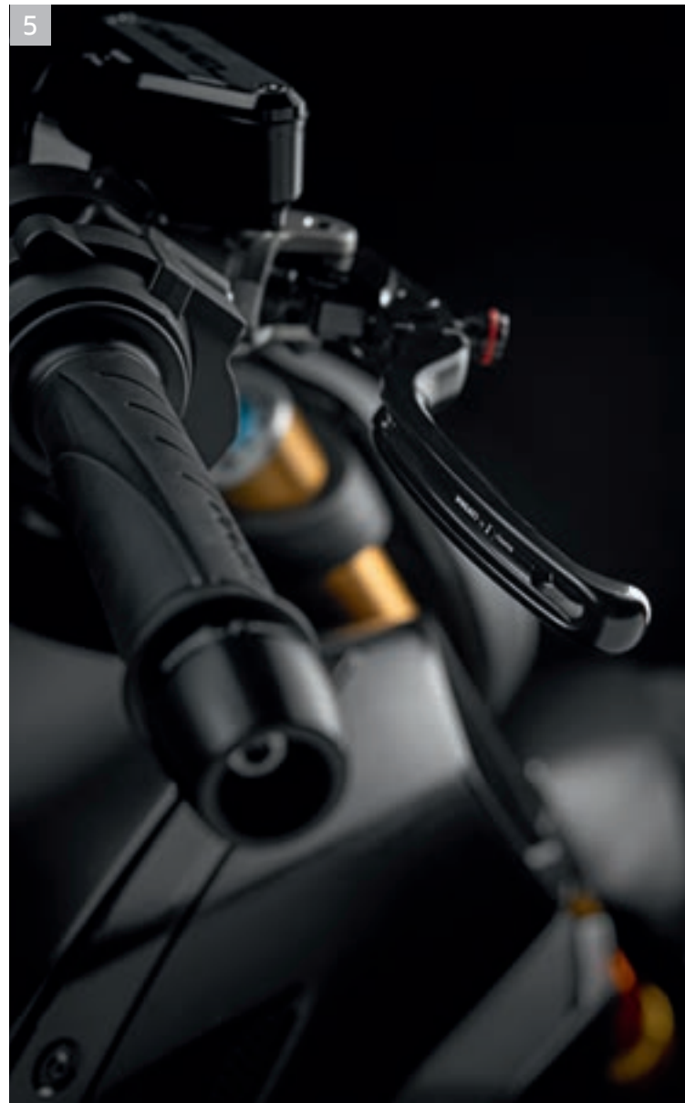
A 5 Brake lever A