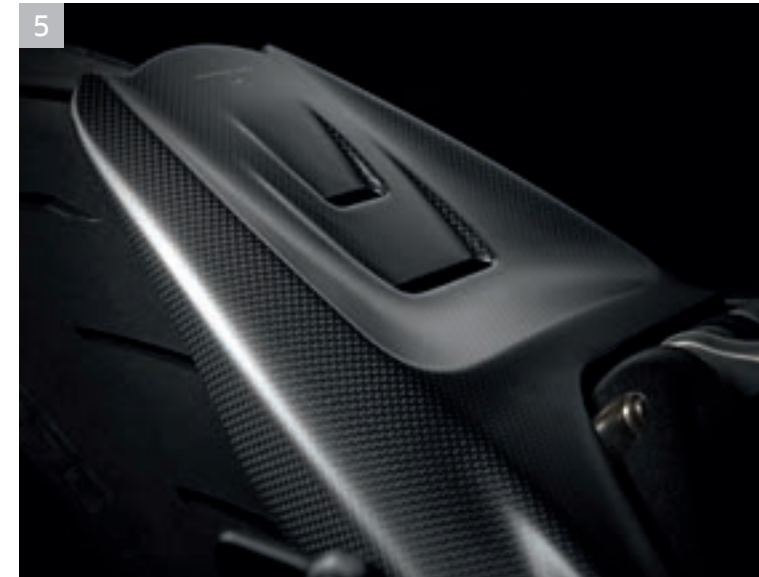
5 Carbon front mudguard