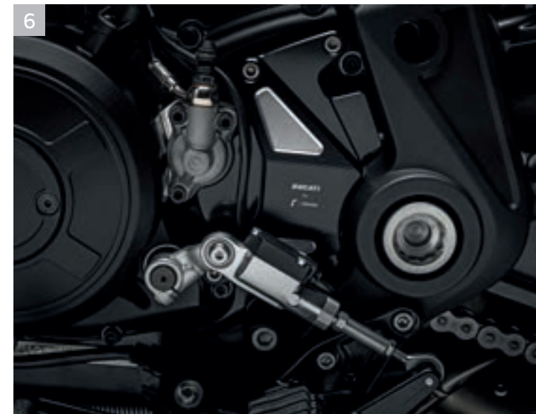
6 Billet aluminium sprocket cover