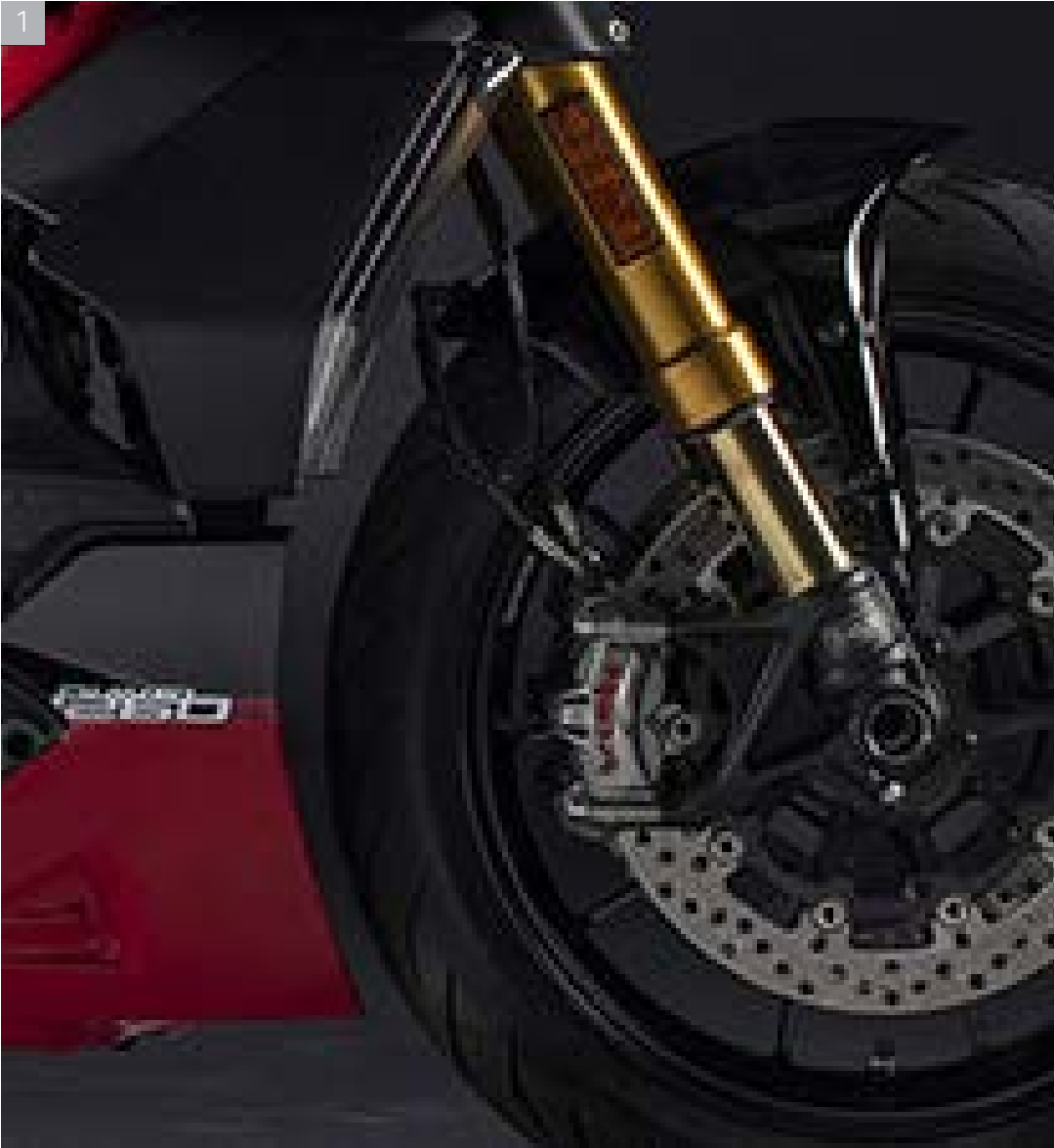
1 Fully adjustable front and rear Öhlins suspension with golden finish

* Please contact your dealer for information on availability.