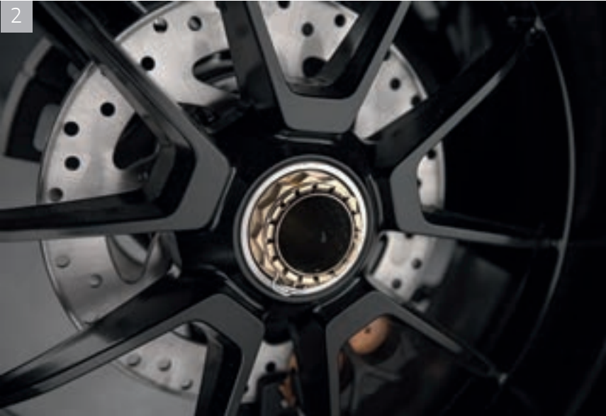
2 Exclusive cast and machine-processed rims