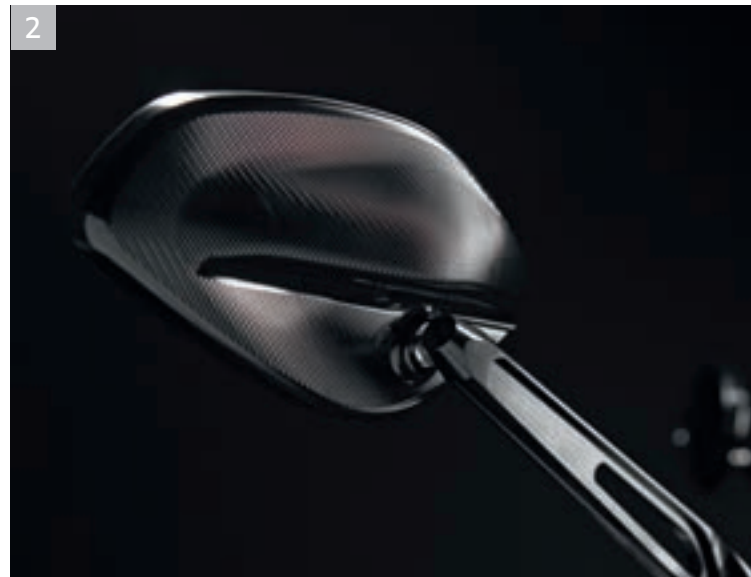
2 Billet aluminium rearview mirrors OK A ■ ■