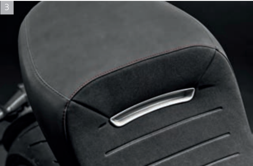
3 Premium seat with Diavel insert