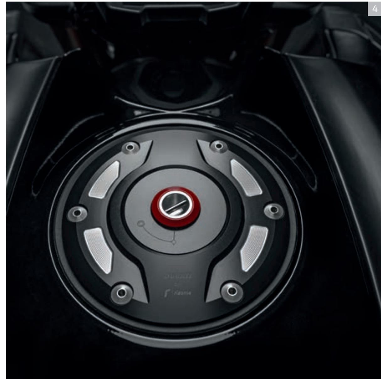
4 Billet aluminium tank cap