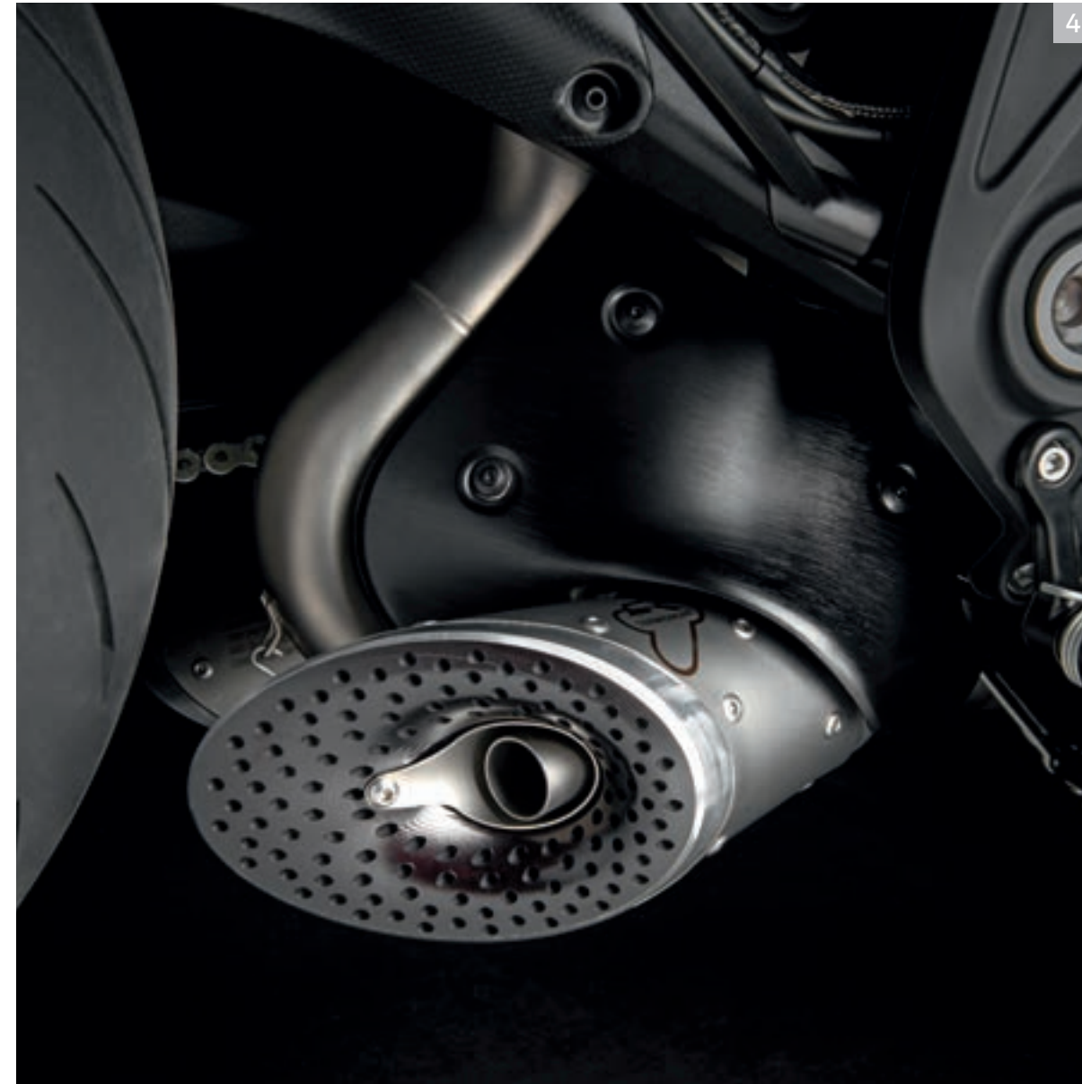
4 Complete exhaust assembly