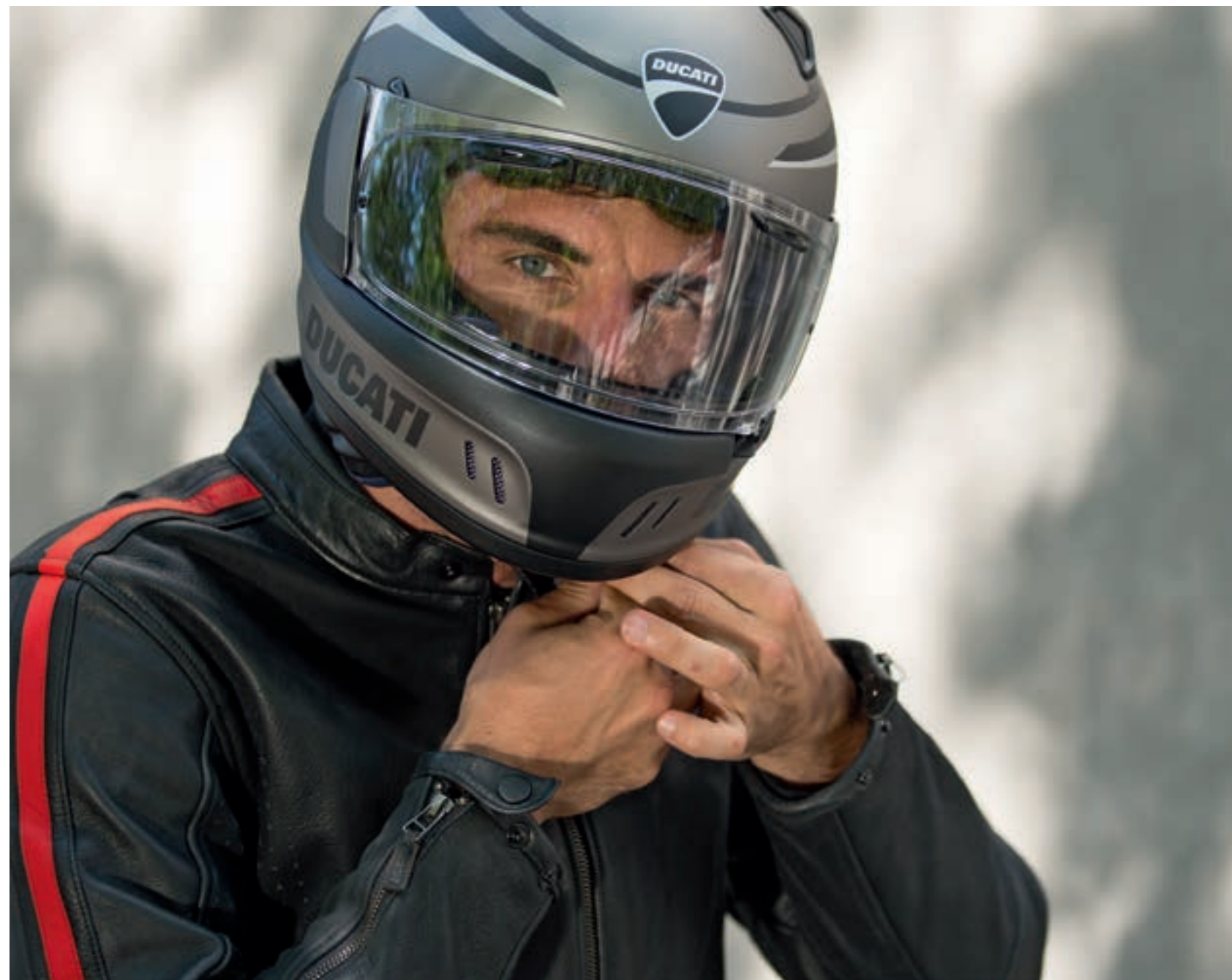
Black Steel Full-face helmet