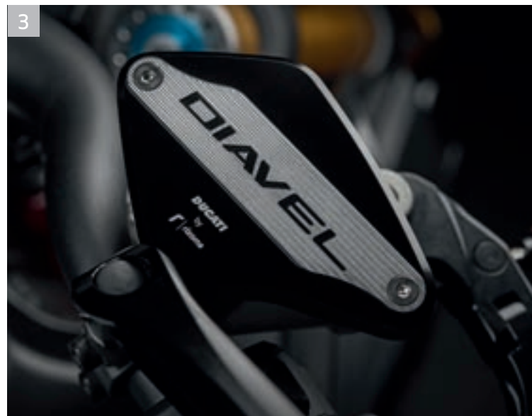
3 Covers for brake and clutch fluid reservoirs A