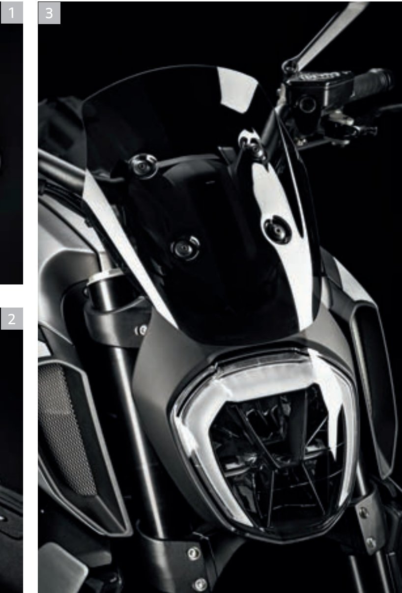
3 Smoked Sport Headlight Fairing