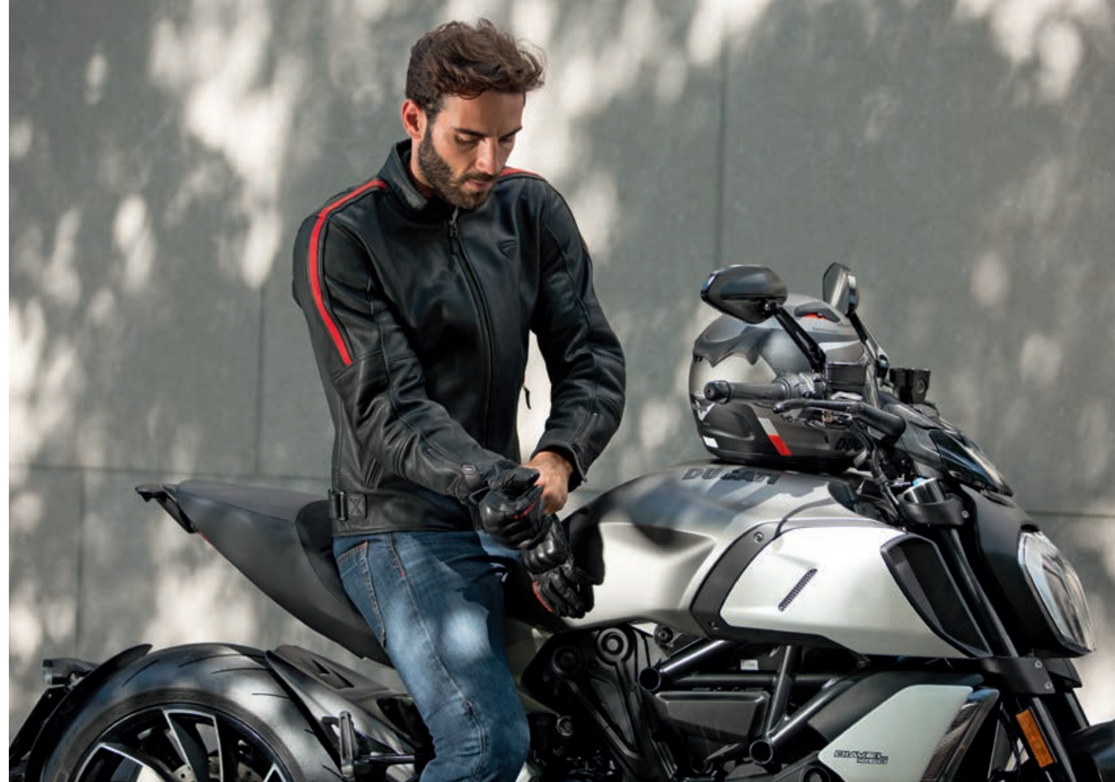
Logo C1 Leather gloves