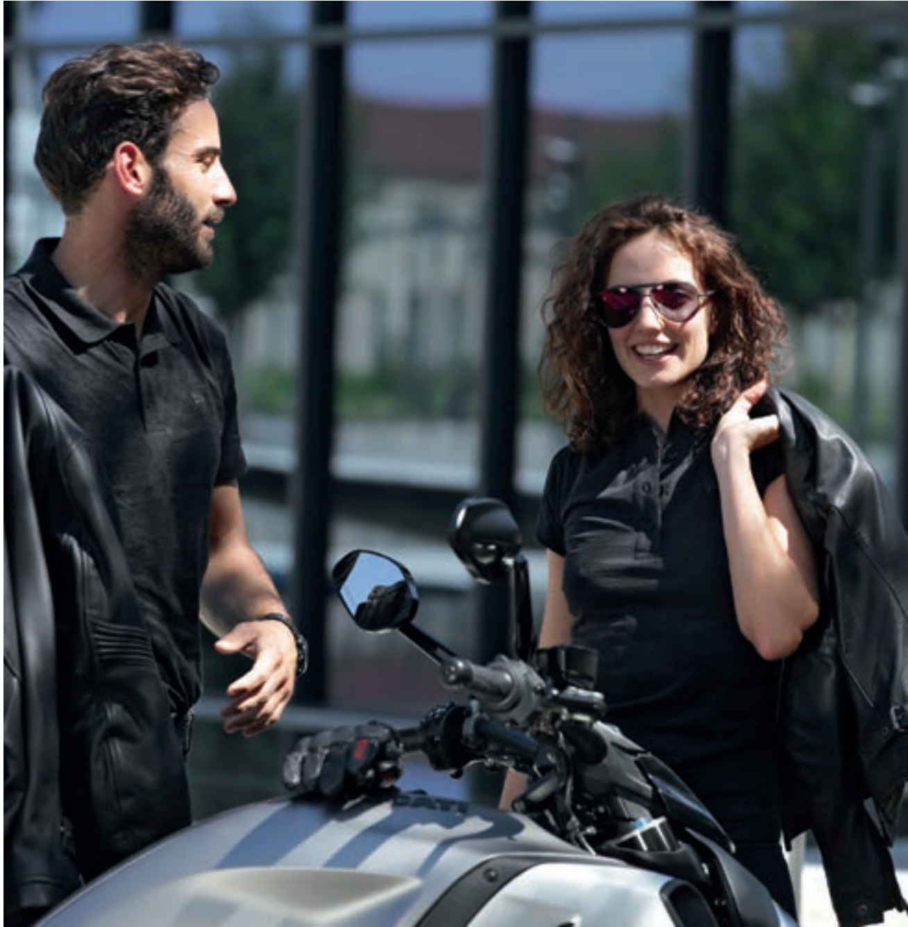
Ducati Apparel Collection designed by Drudi Performance