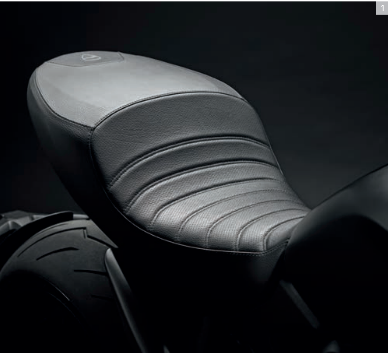
1 Premium seat