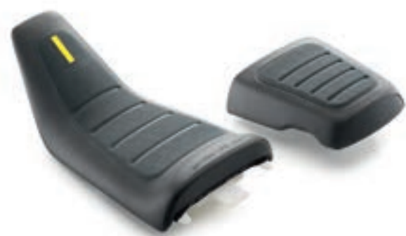
ERGO SEAT ERGO PILLION SEAT