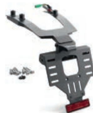
LICENCE PLATE HOLDER SUPPORT