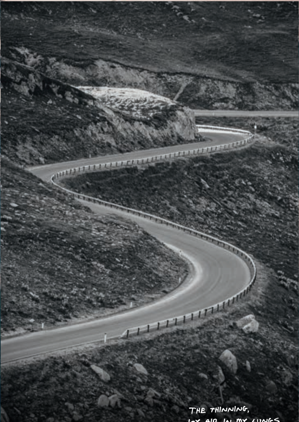
THE THINNING, ICY AIR IN MY LUNGS IS MATCHED ONLY BY THE BREATH-TAKING SCENERY AROUND ME.