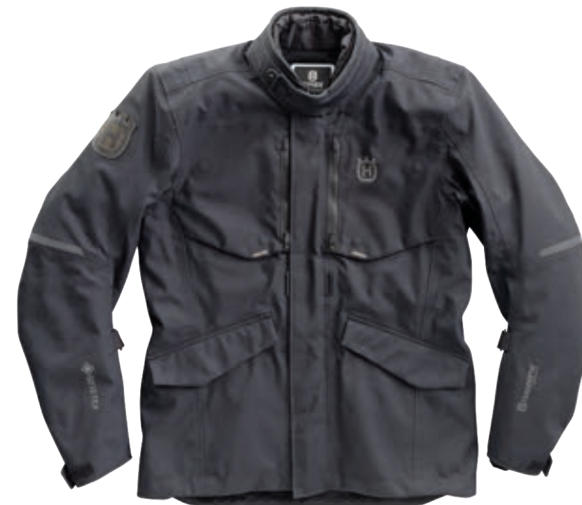
PURSUIT GTX JACKET