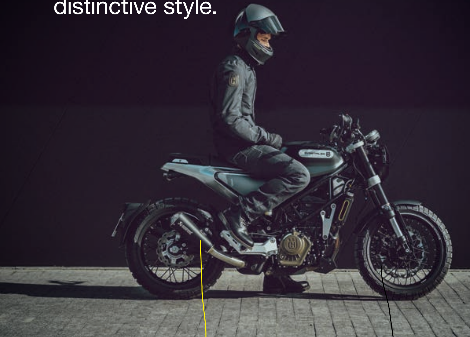
AKRAPOVIČ "SLIP-ON LINE"

Individual performance, distinctive style.