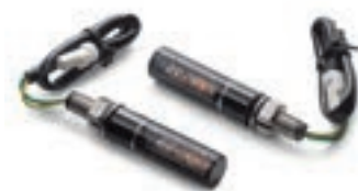
LED INDICATOR KIT