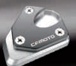
ENLARGED SIDE SUPPORT PEDESTAL