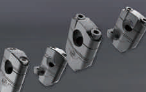
HANDLEBAR HEIGHTENING BLOCK