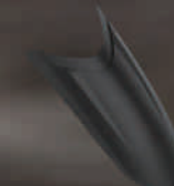
FRONT LENGTHENED FENDER