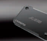
BRAKE CLUTCH OIL CUP COVER