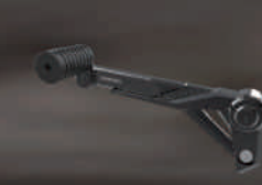
ADJUSTABLE SHIFT ROD