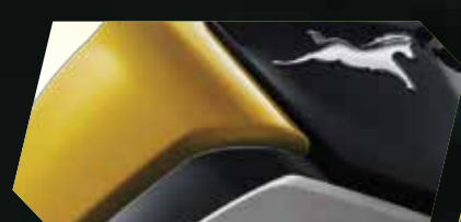
3 TONE COLOUR