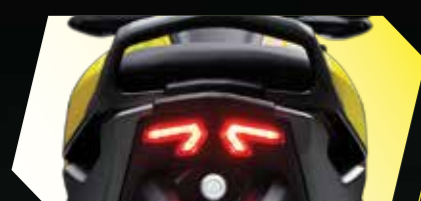
UNIQUE LED TAIL LAMP For better visibility & high mileage