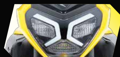
ANIMALISTIC LED HEADLAMP With signature position lamp