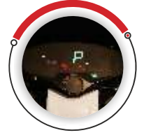
Digital Coloured TFT