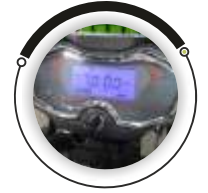
Digital Coloured TFT