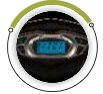
Digital Coloured TFT