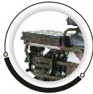
More Boot Space