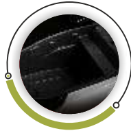
More Boot Space