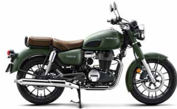
Mat Marshal Green Metallic