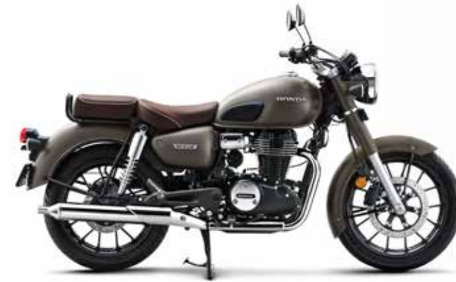
Mat Crust Metallic