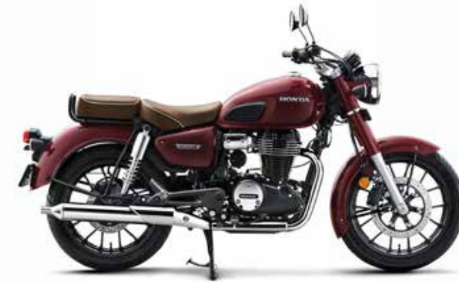
Precious Red Metallic