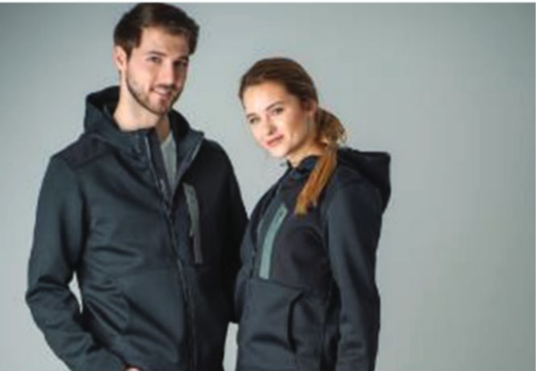
City Jacket (unisex)