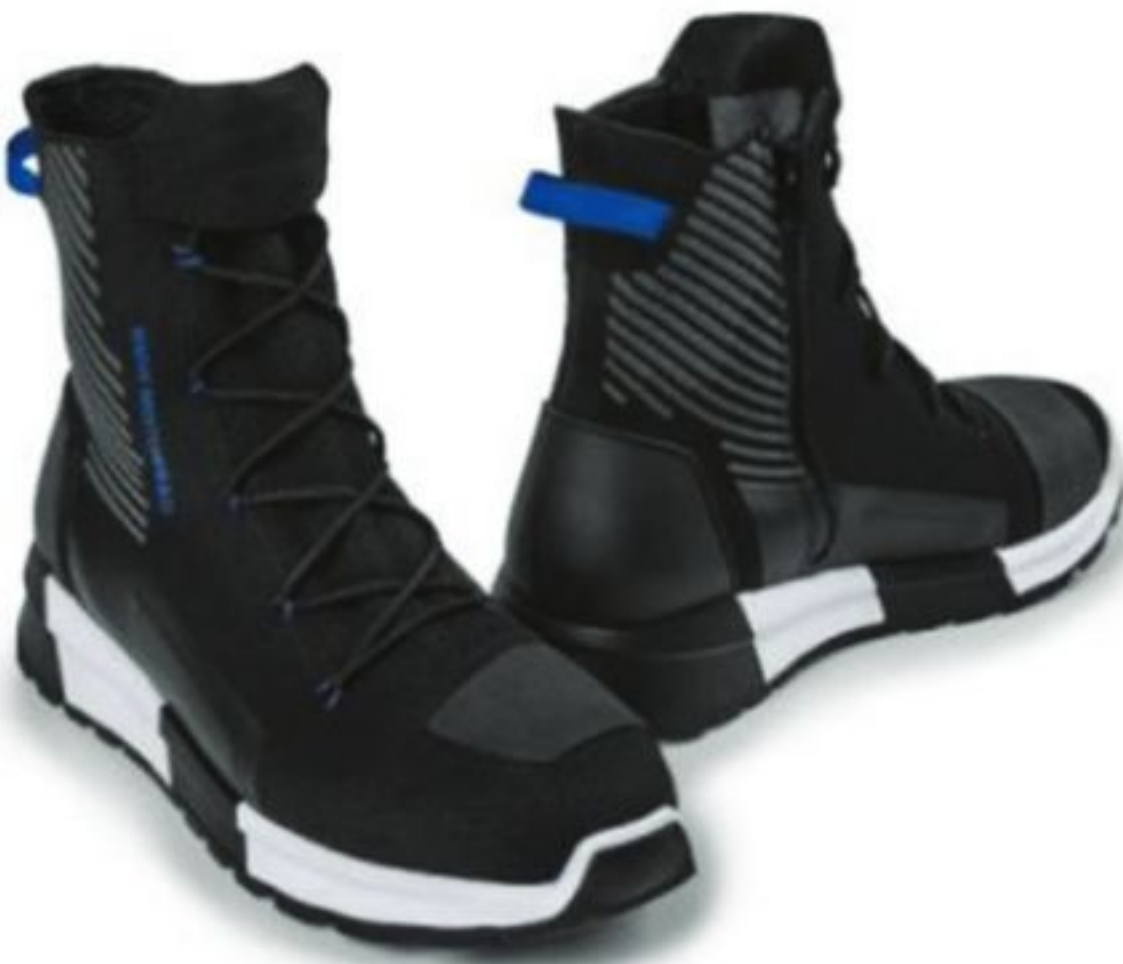
KniteLite Sneaker (men)