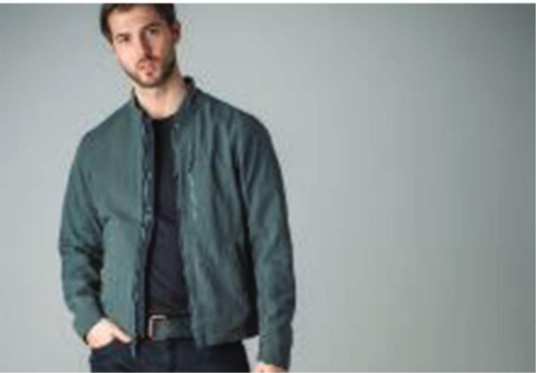
Transformer Jacket (men)