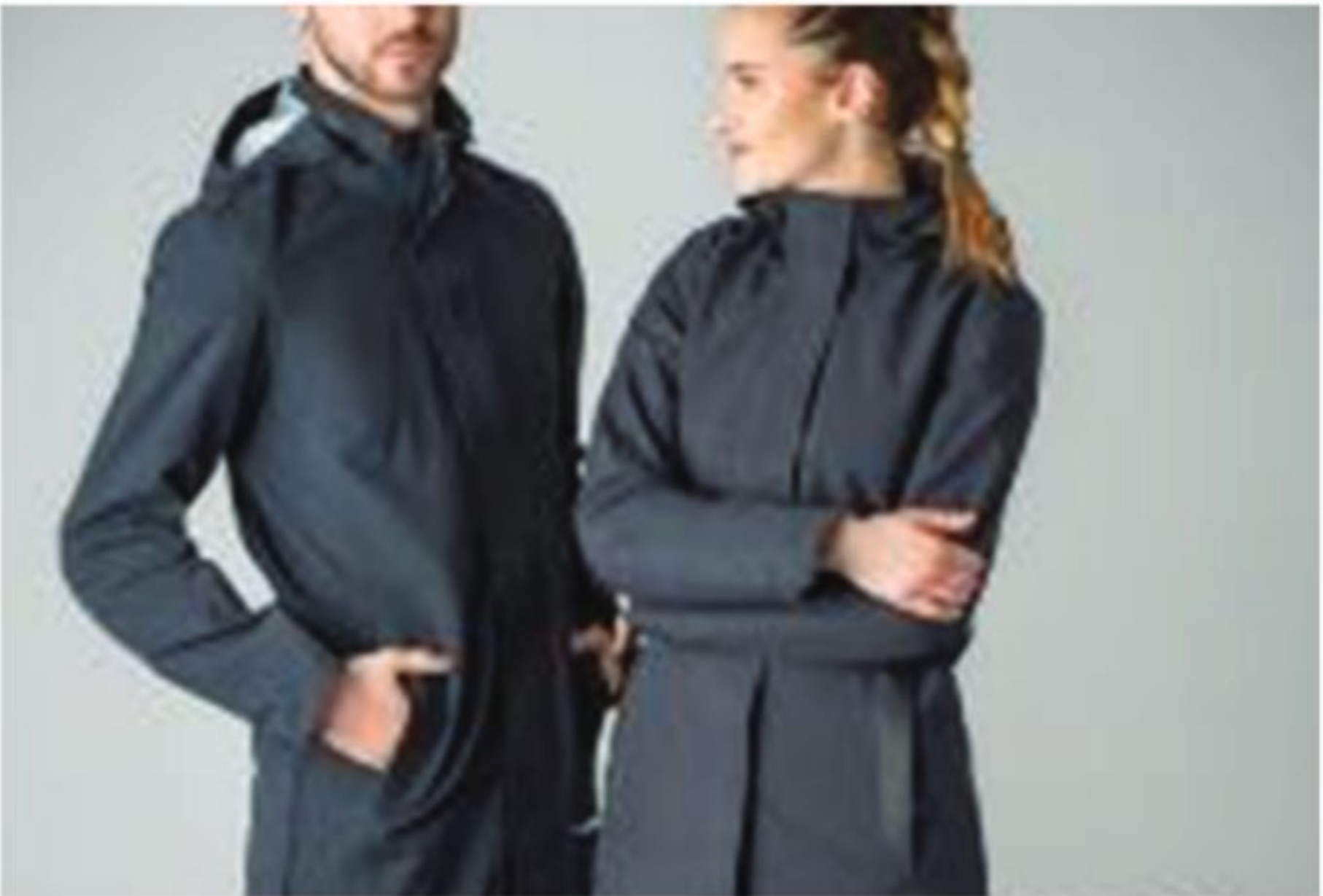
Dry Jacket (unisex)