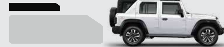
Everest White Black